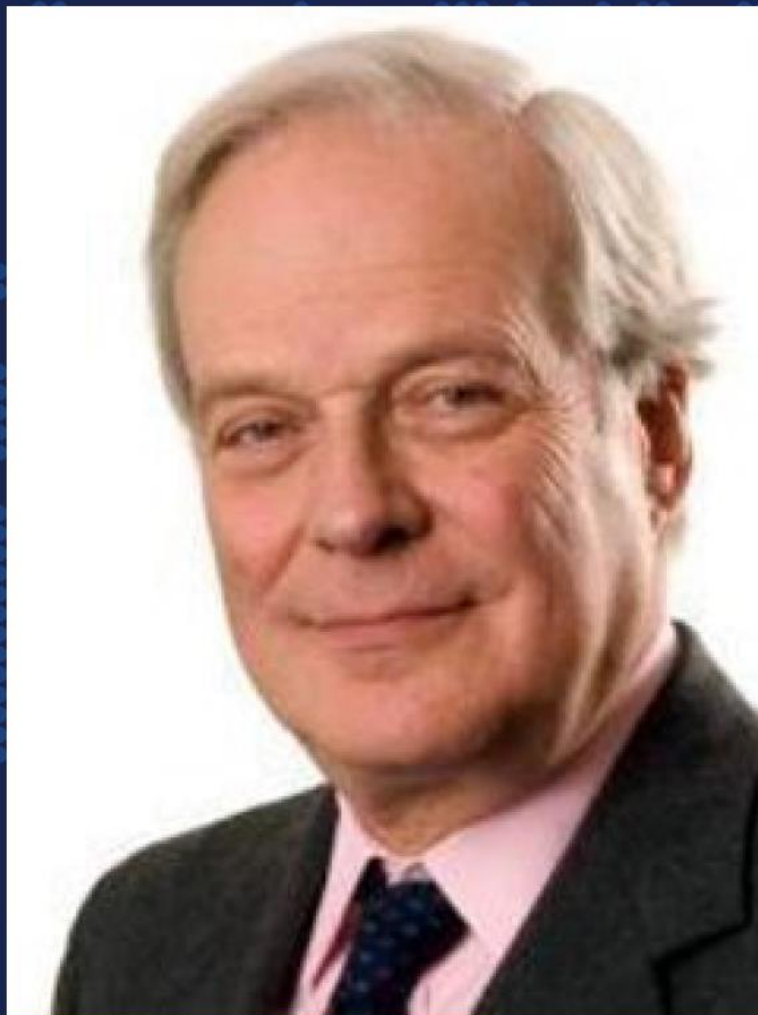
David de Rothschild